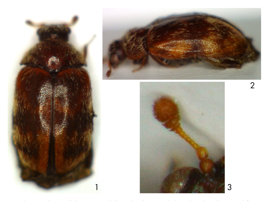
Figs. 1-3. Orphinus (Orphinus) wilhelmi sp. nov.: 1- habitus, dorsal aspect; 2- habitus, dorsa-lateral aspect; 3- left antenna.

Etymology. Topomymic, named after the type locality - Mount Wilhelm.